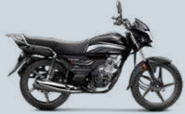
Black with Grey