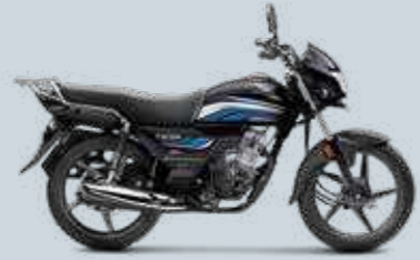
Black with Blue