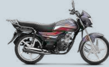
Geny Grey Metallic