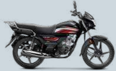
Black with Red