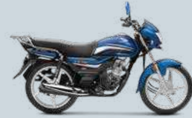
Athletic Blue Metallic