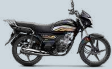
Black with Cabin Gold