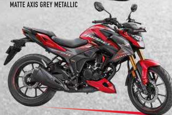
MATTE SANGRIA RED METALLIC

BOOK ONLINE NOW! www.honda2wheelersindia.com