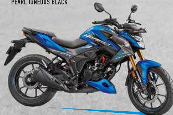
MATTE MARVEL BLUE METALLIC