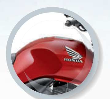
Imperial Red Metallic