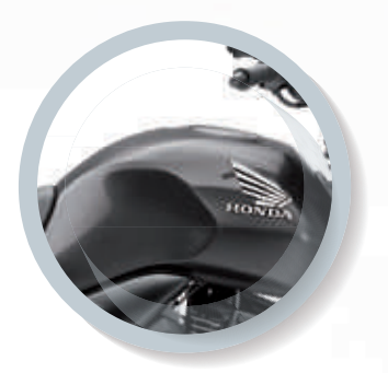
Mat Axis Gray Metallic